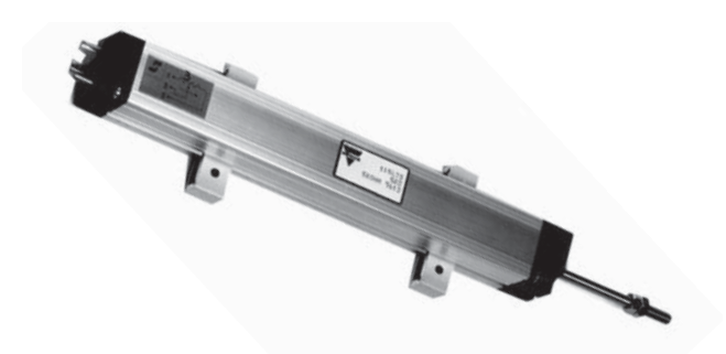
The 115 L is a simply mounted, robust, high precision industrial linear motion transducer.